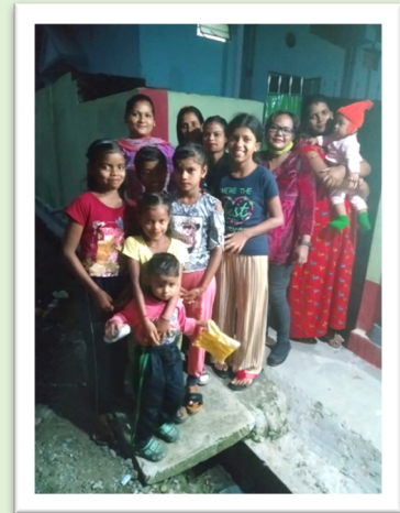
House Visit to seeker 's family.